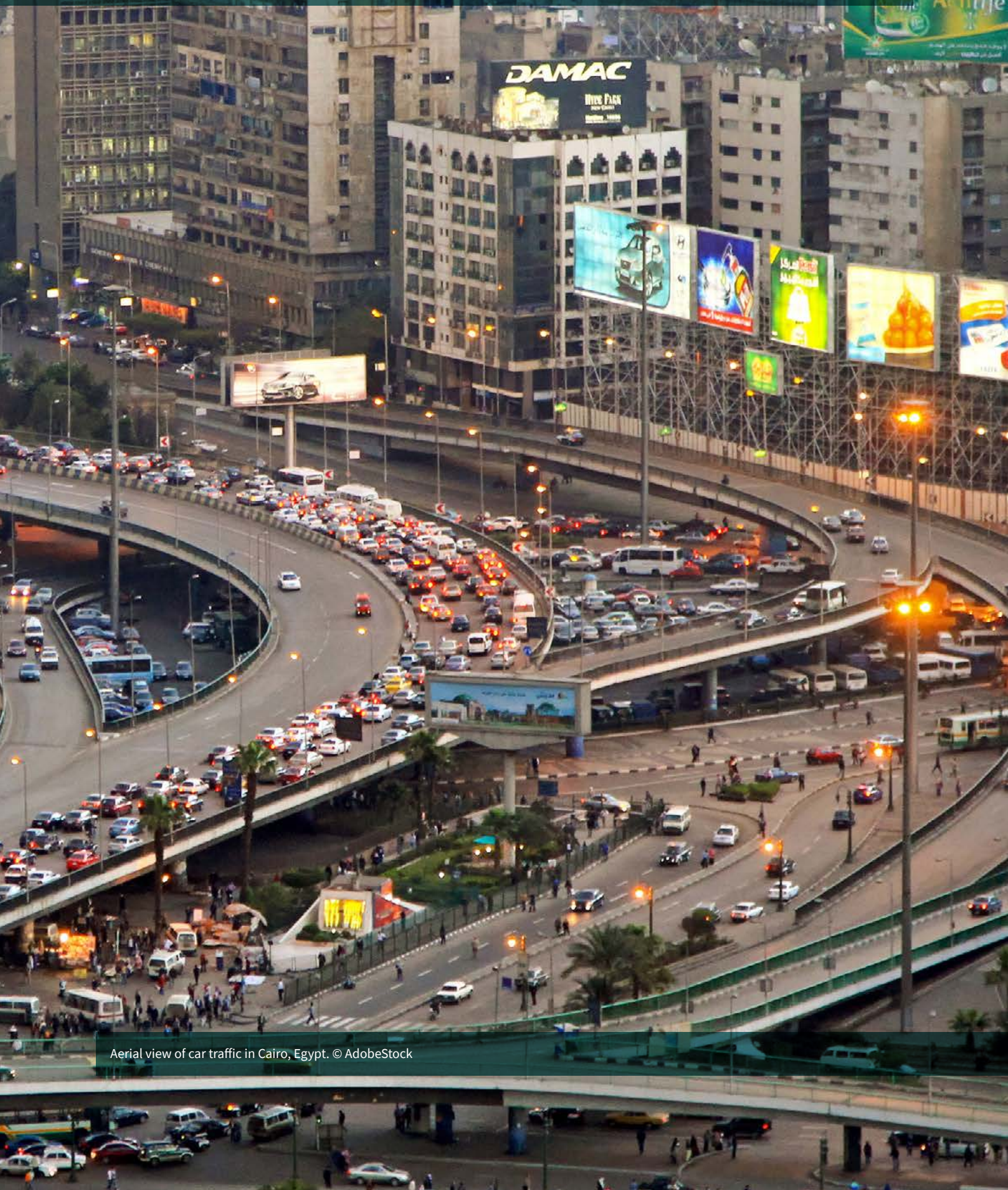
Aerial view of car traffic in Cairo, Egypt.