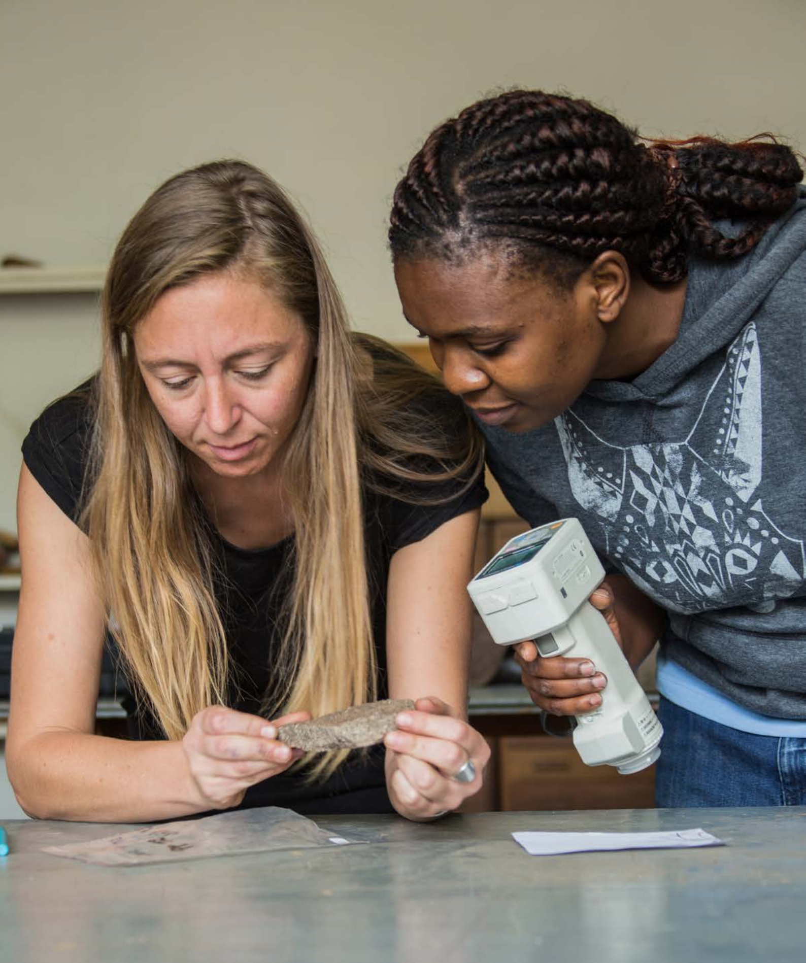
Spectrocolorimetric analysis of a painted wall fragment from previous excavations at the Pomongwe shelter in the Matobo Hills of Zimbabwe held at the Zimbabwe Museum of Humanities in Harare.