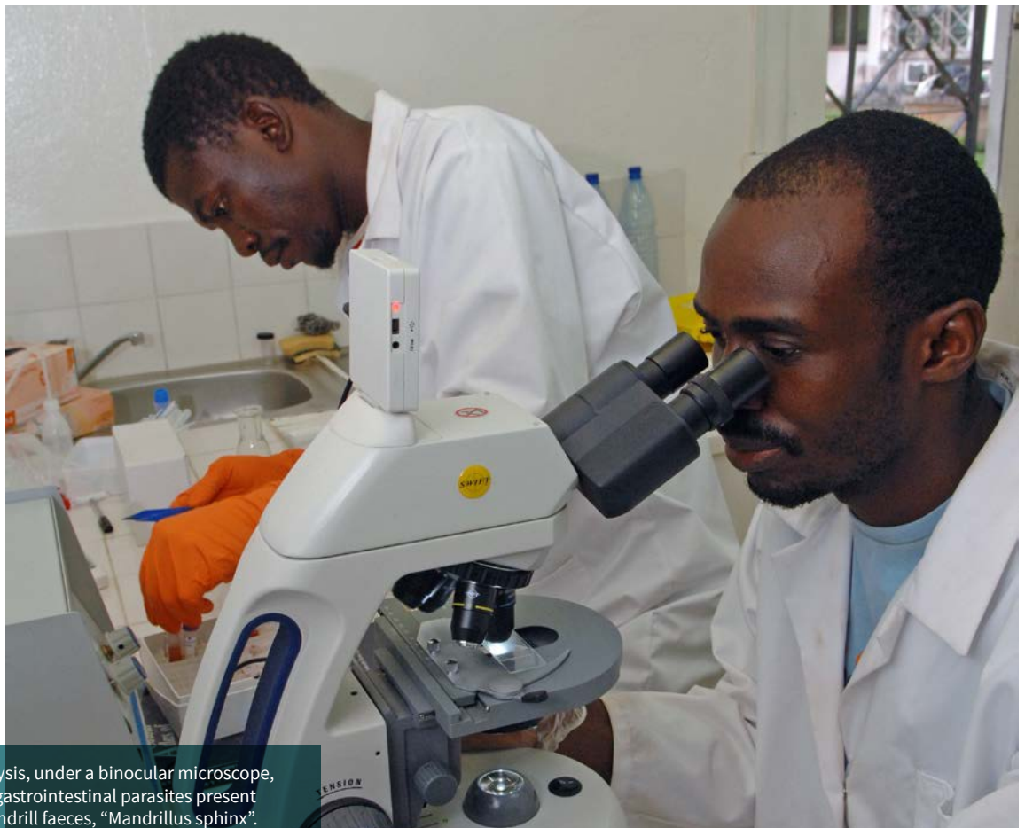
Coprological analysis, under a binocular microscope, to determine the gastrointestinal parasites present in a sample of mandrill faeces, "Mandrillus sphinx".

The CNRS Office in Pretoria therefore represents a key element in the construction of the CNRS strategy and policy in terms of cooperation with Africa, even more so today with the deployment of this multi-year plan. The undeniable benefit of the presence of an office in the field has led the CNRS to consider creating a second office in the short term, or even a third in the medium term.