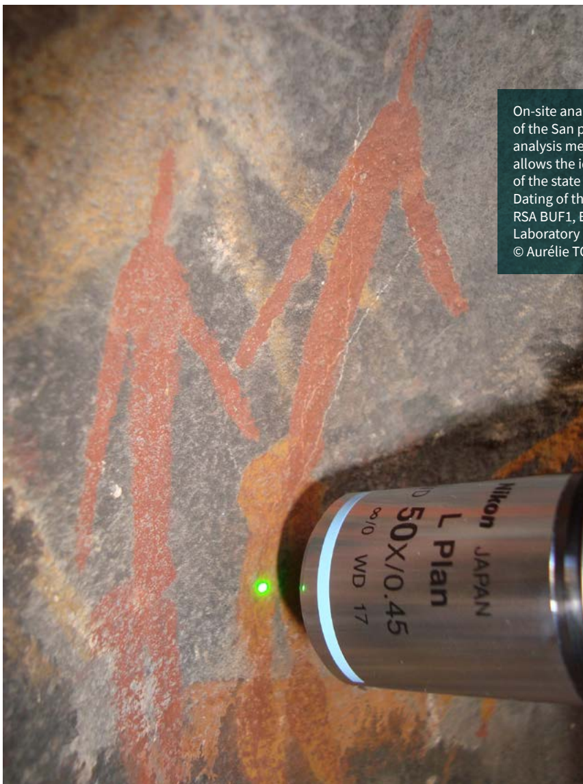
On-site analysis of pigments from a sandstone rock painting of the San people. The non-destructive and portable Raman analysis method (here, the spectrometer measuring head) allows the identification of pigments and the evaluation of the state of conservation of these paintings. Dating of the paintings: from 100 to 3,000 years. RSA BUF1, Eastern Cape, South Africa. LADIR Laboratory of Dynamics, Interactions and Reactivity.

The South African National Research Foundation (NRF) is one of the biggest donors. Other big donors include the European Union, followed by the US National Institutes of Health (NIH), the UK Wellcome Trust Foundation and the German Deutsche Forschungsgemeinschaft (DFG). Others include the Bill & Melinda Gates Foundation, the Government of Spain, the National Natural Science Foundation of China, the Ministry of Higher Education and Scientific Research of Tunisia and the National Institute of Allergy and Infectious Diseases (part of the NIH).