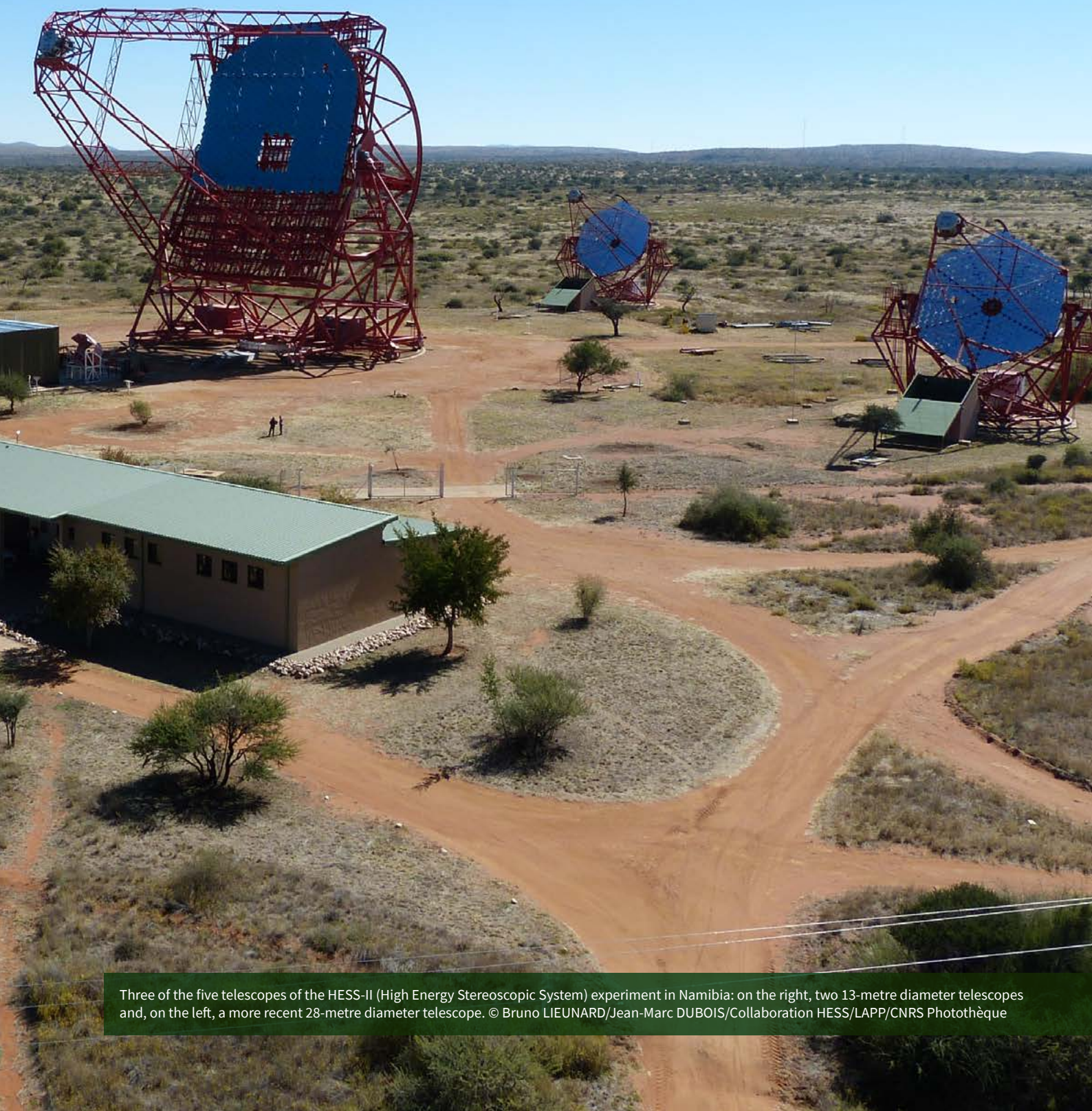
Three of the five telescopes of the HESS-II (High Energy Stereoscopic System) experiment in Namibia: on the right, two 13-metre diameter telescopes and, on the left, a more recent 28-metre diameter telescope.