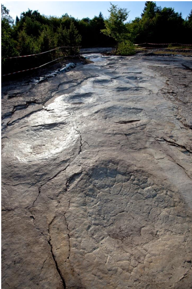
The sauropod trackway.

speed of 4 km/h. It has been assigned to a new ichnospecies 1 : Brontopodus plagnensis . Other dinosaur trackways can be found at the Plagne site, including a series of 18 tracks extending over 38 m, left by a carnivore of the ichnogenus Megalosauripus . The researchers have since covered these tracks to protect them from the elements. But many more remain to be found and studied in Plagne.