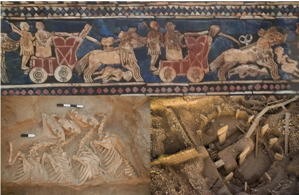
Top: Detail of the “War panel” of the “Standard of Ur”, exhibited in the British Museum, London.