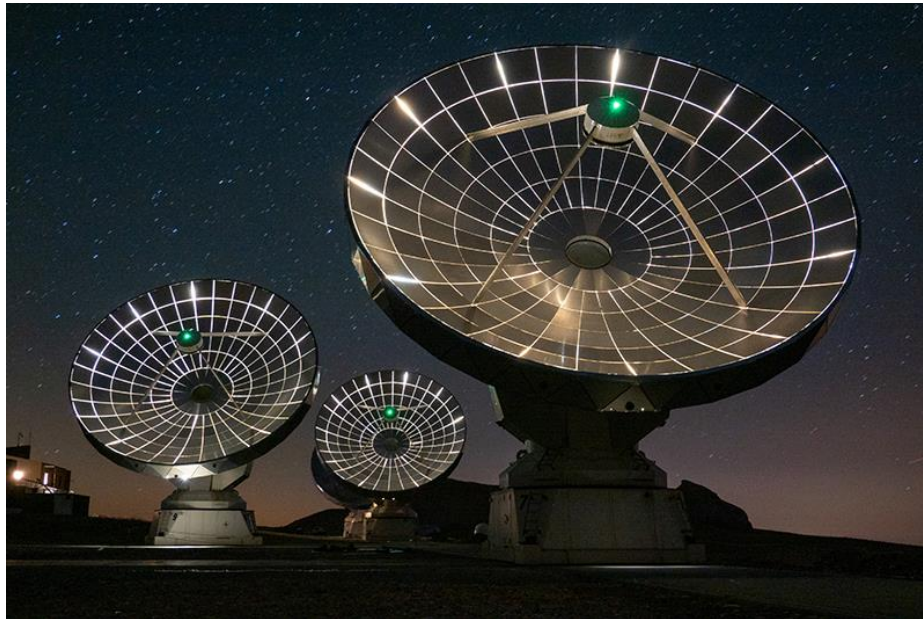
Three of the twelve antennas of the NOEMA radio telescope array.