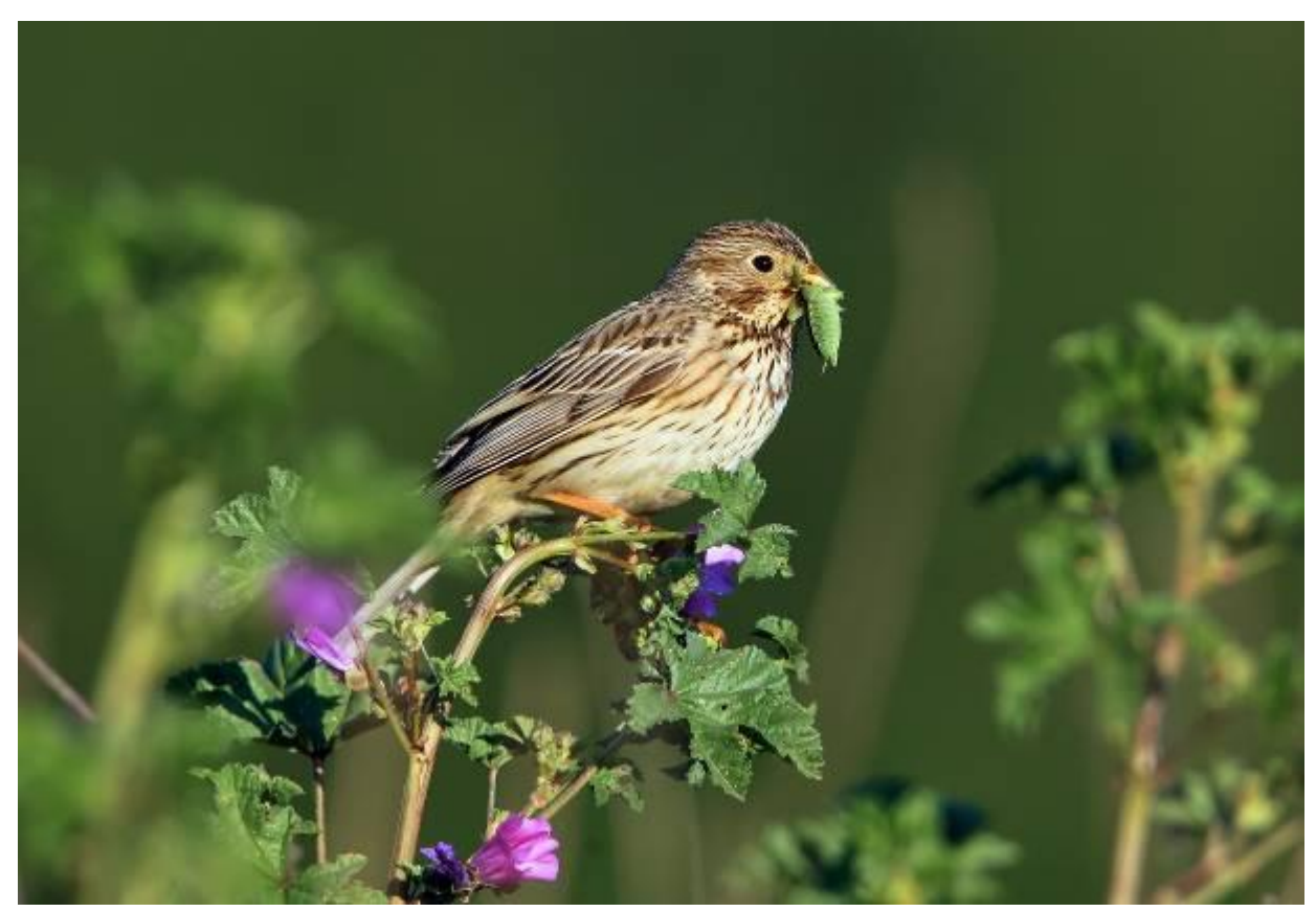
A corn bunting ( Emberiza calandra ). This passerine bird of the bunting family has seen its population decline in Europe, similarly to other farmland-dwelling species.